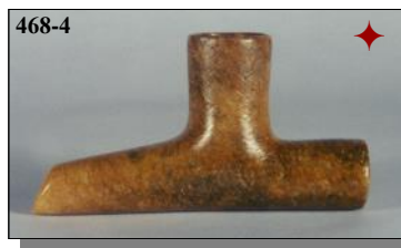
3 3/4" long, 2 1/2" high