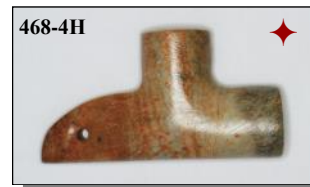
3 3/4" long, 2 1/2" high