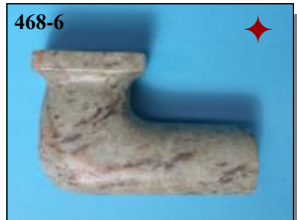
3 1/2" long, 2 1/2" high