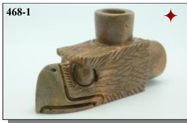
4.5" long, 2 1/4" high