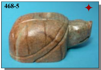
4 1/2" long, 2 1/2" wide, 2" high