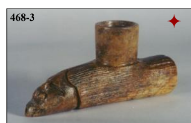
4" long, 2 1/4" high