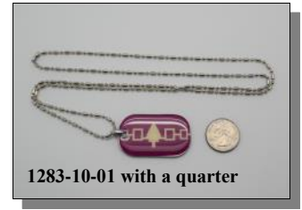
1283-10-01 with a quarter